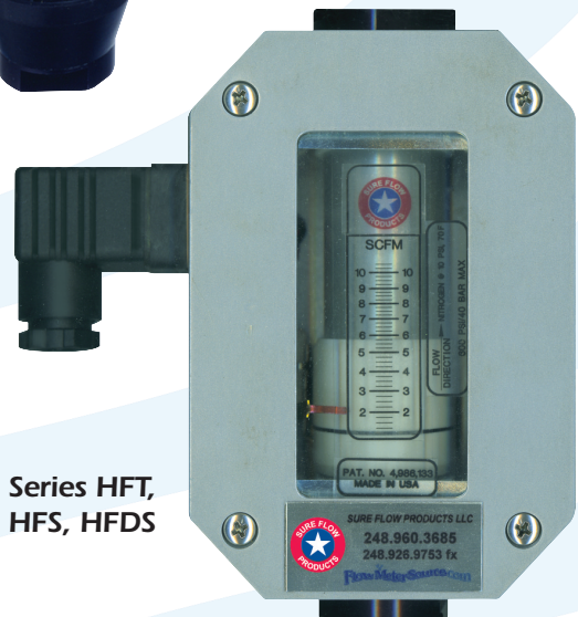
Series HFT, HFS, HFDS